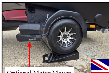
Optional Motor Mover