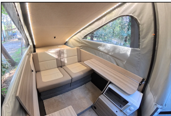
Dashaway eCT lounge has inclined squabs with reclined backrests giving a very comfortable sofa. Fold-down flaps on each side provide worktop space and tables, they’re steady too. The eCT travels with bed down and sleeping bag laid out on top.

Standard equipment includes: Three alloy wheels including a spare, mounted on the drawbar, or placed inside the tow car’s boot (12kgs). High-level hooks for coats and rubbish bag. Thermostatically controlled electric fan heater (needs campsite hook-up if required all night - tested in Iceland). Led lights give excellent, even lighting, dimmable too. Fold-down worktops/tables.