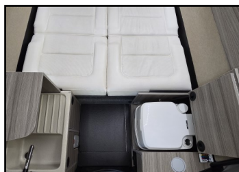
Porta Potti can be used inside

With campsite permission which is normally granted in our experience, we use the campsite hook-up to charge the tow-car's E.V. battery, set to draw a modest 6-8amps once cooking has finished, ie when you go to bed.