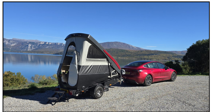
Just two steps up into Dashaway eCT camper with full standing headroom. Huge vents/windows in the side fabric create a pleasant, light and relaxing lounge.

Standard equipment includes: Three alloy wheels including a spare, mounted on the drawbar, or placed inside the tow car's boot (12kgs). High-level hooks for coats and rubbish bag.