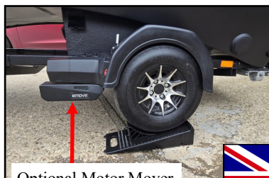
Optional Motor Mover