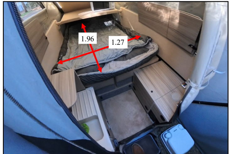
Double bed with Porta Potti seen outside in the awning. Drop down shelf across the front provides a night-time space for the cooking appliances such as the induction hob and microwave etc. above your feet in the bed (or they can go in the awning).