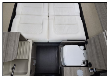
Porta Potti can be used inside

With campsite permission which is normally granted in our experience, we use the campsite hook-up to charge the tow-car's E.V. battery, set to draw a modest 6-8amps once cooking has finished, ie when you go to bed.