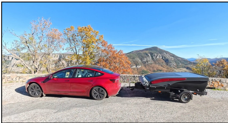
Low enough to retain rear visibility and give good efficiency, high enough to see when reversing. “Accents” painted to match your car. Gorges Du Verdon, France.

The Dashaway eCT has campsite mains hook-up with large onboard Lithium batteries and a 2600w inverter supplying 230v so you can cook using domestic 3-pin appliances such as the standard microwave and induction hob, plus optional oven, air fryer, kettle etc. in fact any 230v appliance up to 2600watts. A large 200watt solar panel is standard, too, as is a 12ltr compressor fridge.