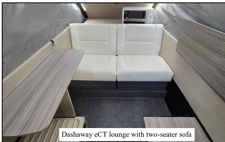
Dashaway eCT lounge with two-seater sofa

Fold-down flaps on each side provide worktop space and tables, they're steady too.