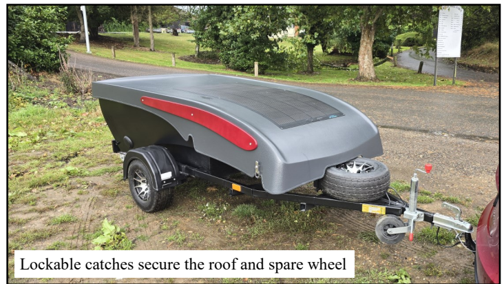
Lockable catches secure the roof and spare wheel