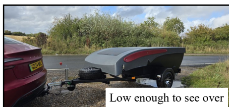
Low enough to see over

This typically adds 7 miles of range per hour, so if we start charging at say, 5pm and depart the site at say, 10am the next day, that's 17 hours of charging so will have added a very useful approx. 119 miles of range (17 x 7) in that time.