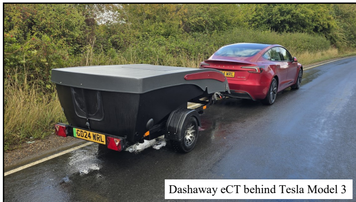
Dashaway eCT behind Tesla Model 3

In it's standard form the Dashaway eCT weighs just 360kgs and can supply sufficient power for three nights of off-grid living. Additional batteries are available at extra cost for even more days off-grid.